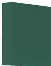
2FTR-ISO COARSE 65% (G4)-DEPURO PRO 150